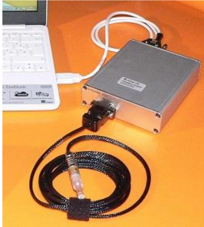
Figure 2 – The Z-Scope eddy current instrument

The initial approach developed by SALM engineers was to measure the remaining thickness of the inverted U-shape bottom with an ultrasound thickness meter. However, the thickness to be measured is already very small, about 0.8 mm, and the acceptable remaining thickness is much smaller, about 0.3 mm. The ultrasonic instrument could not indicate a thickness smaller than 0.6 mm: it gives 0.6 mm for all inferior thicknesses. This was obviously unacceptable for SALM engineers.